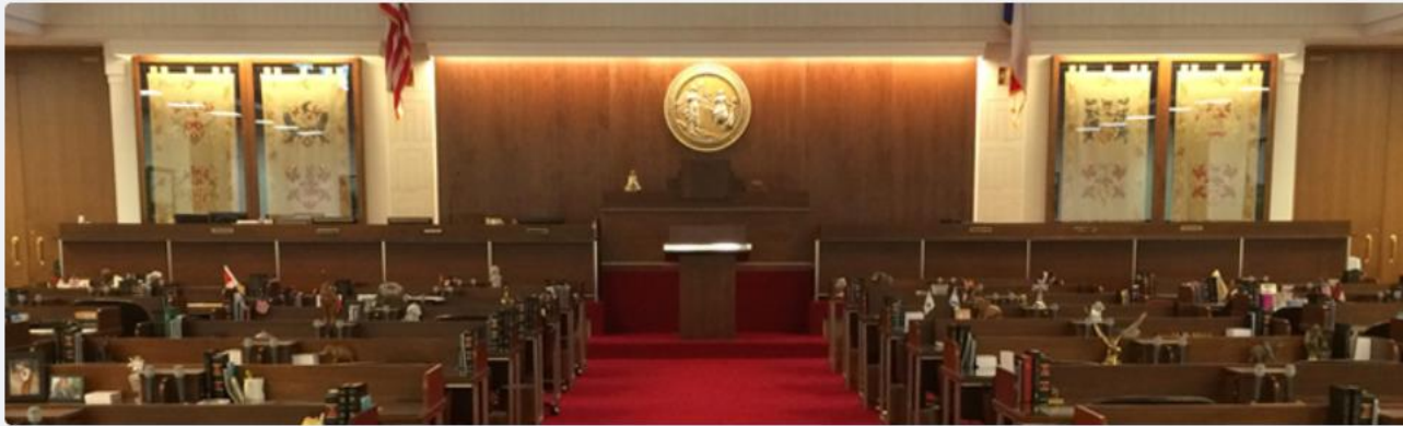
North Carolina House of Representatives, North Carolina General Assembly Raleigh, North Carolina