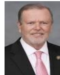
NC President Pro Tempore of the Senate Phil Berger