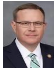
NC General Assembly House Speaker Tim Moore