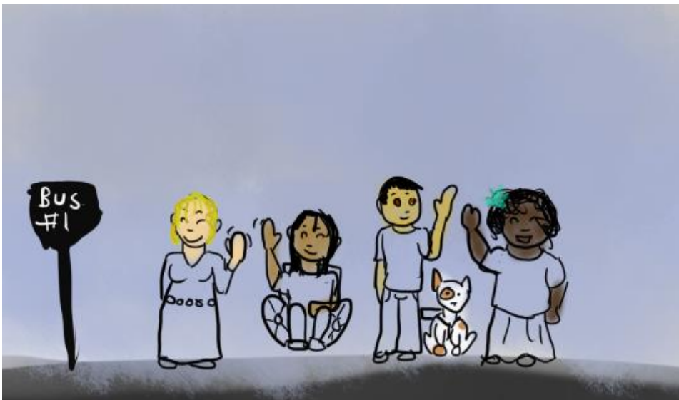
[Above: An illustration by Corbin K. Four smiling people standing and waving. There is a sign reading “Bus #1” next to them.]